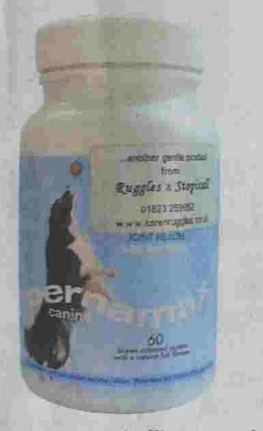
Ruggles & Stopitall's Maxavita Pernamax supplement contains Green Lipped Mussel (GLM) – a rich natural sources of Omega 3

Is your gun dog affected with stiffness in joints and limbs throughout the colder weather? It is a well-known fact that Omega