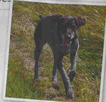
Kia, a 10-year-old Wirehaired Pointer, has benefited greatly from daily Omega 3

in fact, it's a fundamental building block for good health. So how do you increase Omega 3 for stiff joints and/or aging bodies? One option for your dog is from one of the richest natural sources of Omega 3 — Green Lipped Mussel (GLM). But as ever, how do you know whether freeze-dried, cooked or cold-process GLM is best?