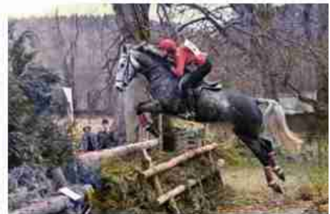
In 1976, aged 13 on Stahlberg, a few months before the 'big fall' off another horse that had the heart attack. One of the last times I was physically able to do X Country!