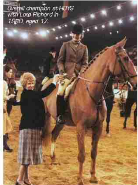
Overall champion at HOYS with Lord Richard in 1980, aged 17.

For more information on Stop-it-All visit www.karenruggles.co.uk or call 01823 259952.